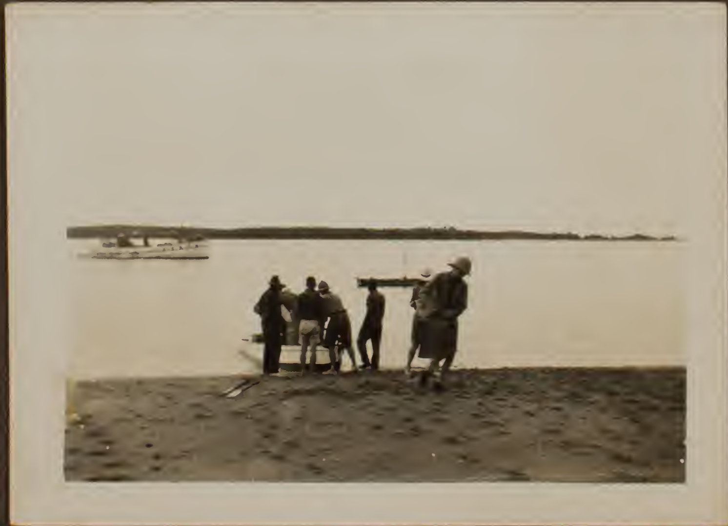
Low-Jobs 22 11 20